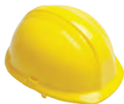
Centurion 1125 Reduced Peak Safety Helmet