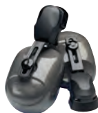
Centurion Helmet Mounted Ear Defenders