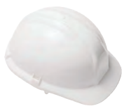
Centurion 1125 Full Peak Safety Helmet